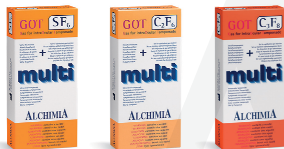
GOT 007 GOT 008 GOT 009

Each pack contains 1 gas cylinder + 1 gas injection set + 1 needle and 1 patient's wristband