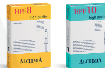
HPF 019 HPF 021